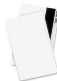
Proximity Job Badges