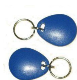
Proximity employee key-ring fobs